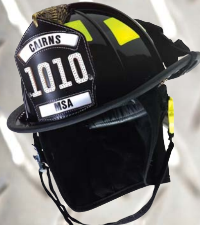
Cairns 1010™ Helmet Superior balance in a classic design