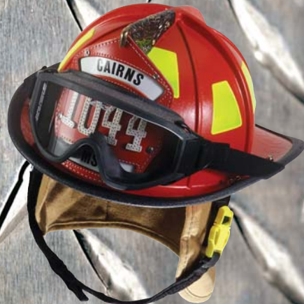
Cairns 1044™ Helmet Rugged design, everyday toughness