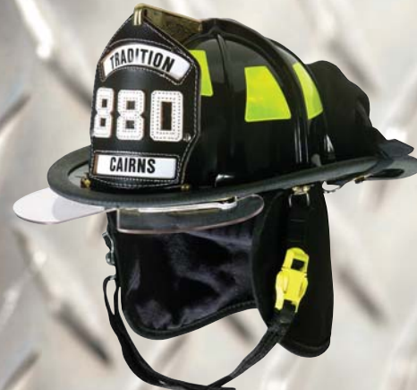
880 Tradition® Helmet Lightweight, low-profile performance