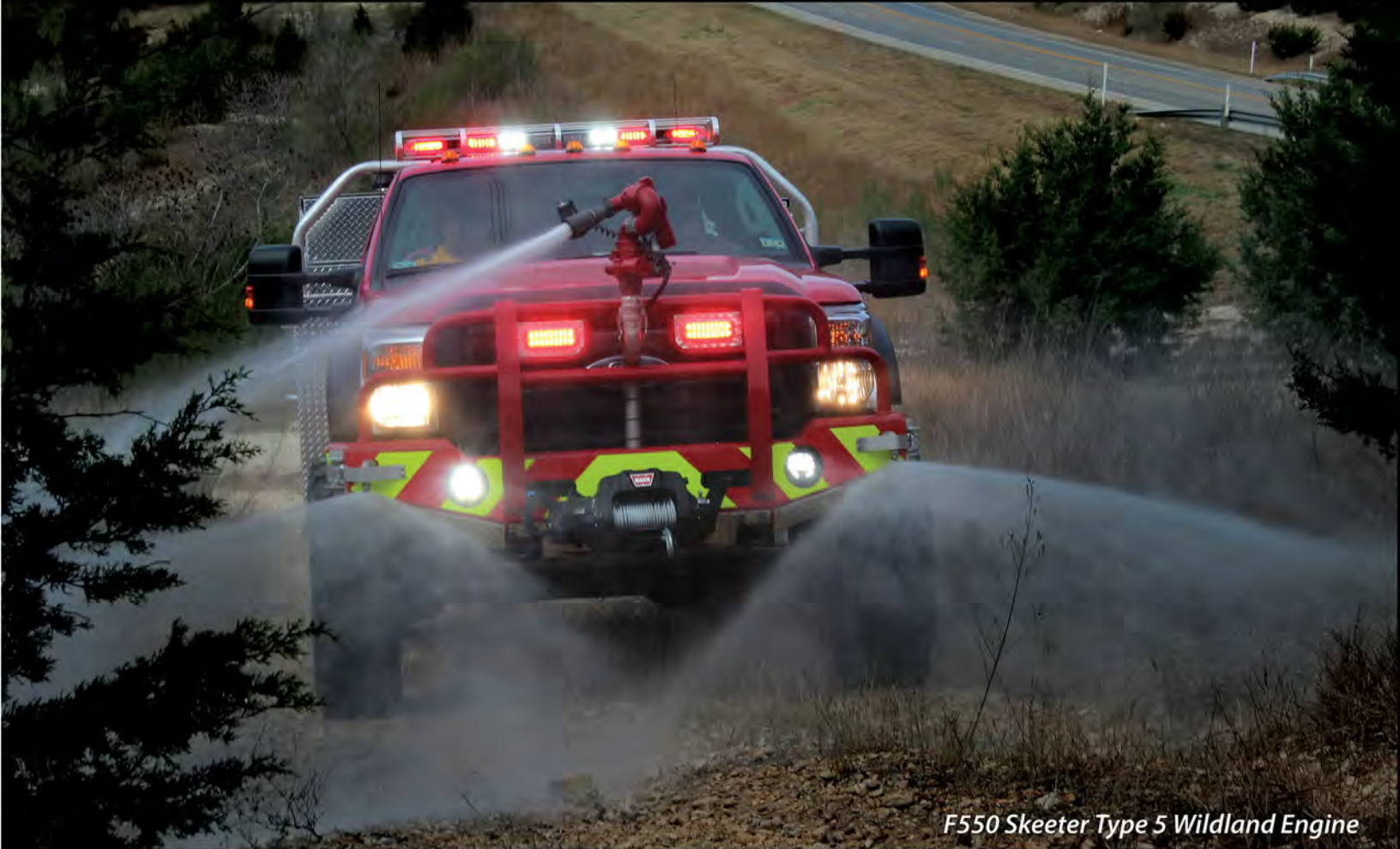
F550 Skeeter Type 5 Wildland Engine

WILDLAND ENGINE, FIRST RESPONDER, RAPID INTERVENTION UNIT