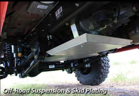
Off-Road Suspension & Skid Plating