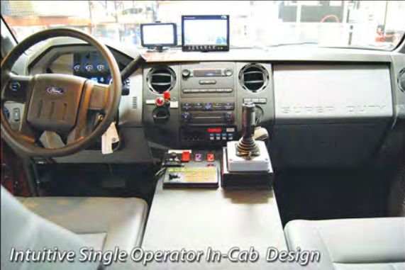
Intuitive Single Operator In-Cab Design