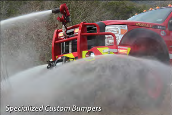
Specialized Custom Bumpers