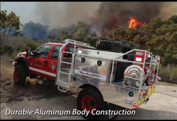
Durable Aluminum Body Construction