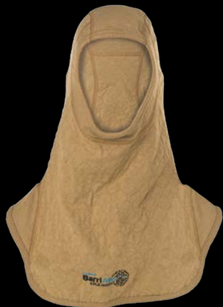
3979471 Complete Coverage