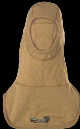
3979471-1 Critical Coverage