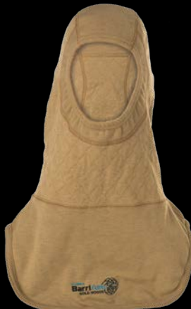
3979471-1 Critical Coverage