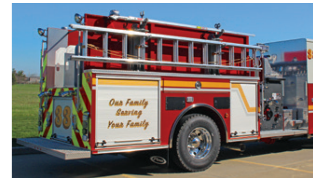
Drop down ladder storage