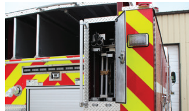
Chest height ladder storage