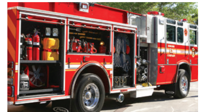
Flexible storage options