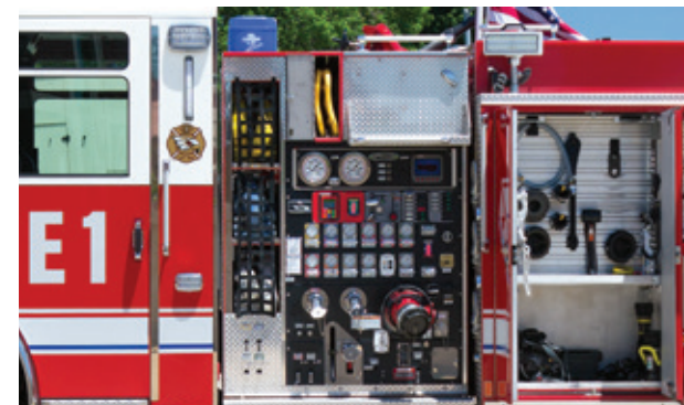
Flexible speedlay options