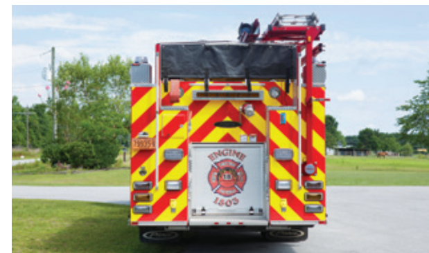
Aluminum, vinyl, netted, and rollup covers