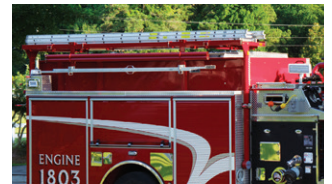
Hydraulic ladder rack