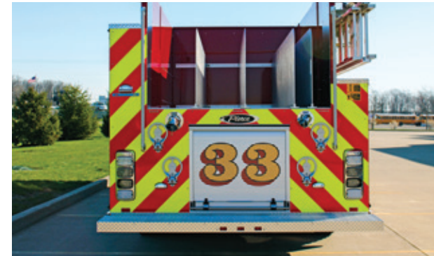
Low hose beds

We offer a robust line of customizable storage solutions to optimize space, response time, and firefighter safety.